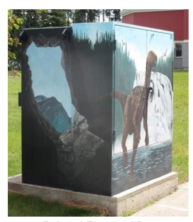
Painted Electrical Box

Life-like scenes of caves, mountains, waterfalls and dinosaurs were painted on this electrical box in 2009 by Joan Zimmer.