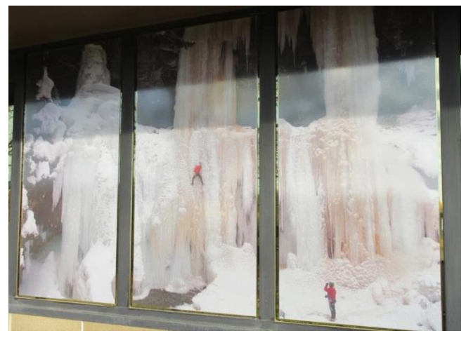
Ice Climbing Photo