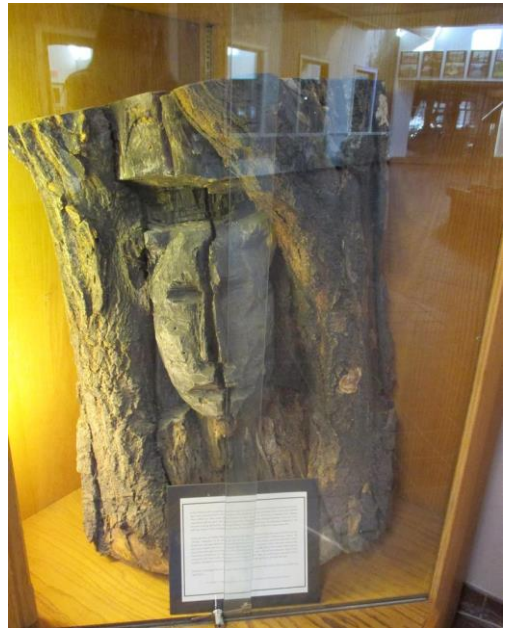
A Culturally Modified Tree found near Flatbed Creek