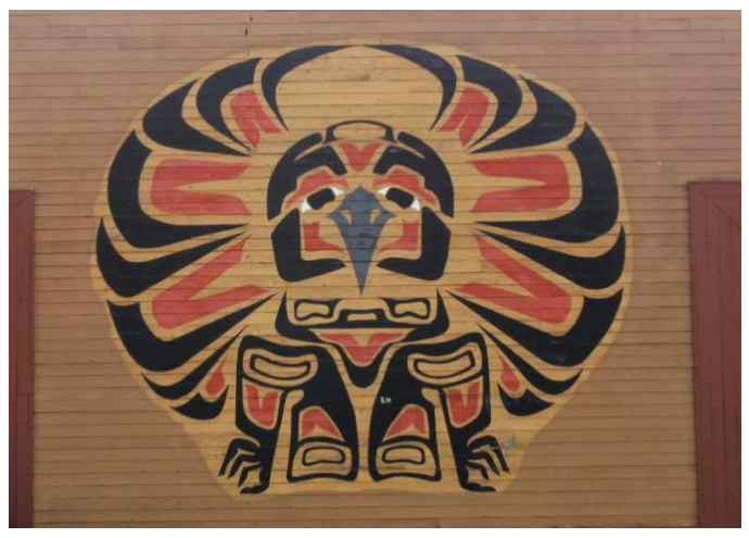
Indigenous Art on Shop Easy Building

This indigenous artwork has been on the outside of the grocery store in town since the early years.