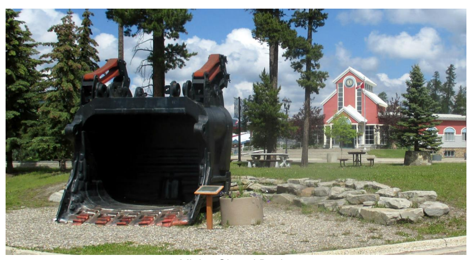
Mining Shovel Bucket

This bucket is from a P&H electric shovel, model 2100BL. It was donated by Teck Corporation and installed here by LaPrairie Crane in August 2005 to commemorate the two original coal mines in Tumbler Ridge. The Quintette mine was originally owned by Denison Mines Ltd., and the Bullmoose mine was owned by Teck Resources Ltd. The bucket has a capacity of 15 cubic yards - stand inside and see how big it really is!