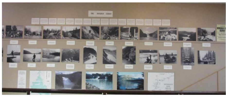
The Monkman Exhibit in the Tumbler Ridge Community Centre

The Tumbler Ridge Museum Foundation has thirty displays in the Community Centre, including the history of the early explorers and pioneers, the first maps of the area, information on archaeology, the creation of Tumbler Ridge, fossil displays and a Sports Hall of Fame.