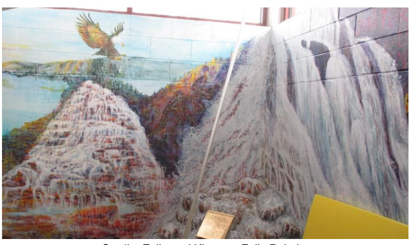
Quality Falls and Kinuseo Falls Painting