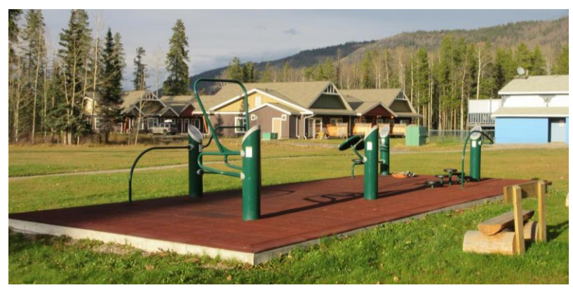
Outdoor Exercise Park

This outdoor exercise park was built here to be close to the seniors housing complex. It was installed in 2011, and has benches for resting between sets of exercise.