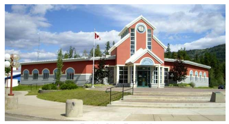
Tumbler Ridge Town Hall

The municipality of Tumbler Ridge was incorporated in April 1981, with construction of the town infrastructure happening over the next two years. This included the Town Hall, which was designed by Downs/Archambault Architects and won an award by the Architectural Institute of British Columbia in 1984. Seen from above, this building is shaped like a dove. Inside you will find council chambers, friendly staff, and a stuffed grizzly bear.