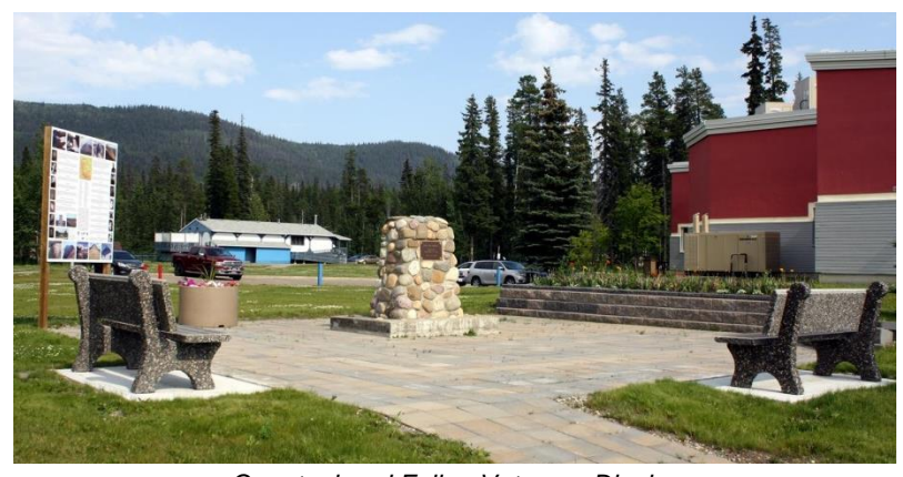
Cenotaphand Fallen Veterans Display

In 2015 the cenotaph area was greatly enhanced. Benches were added, the stone walkway was laid down, and a sign was installed commemorating fallen World War II soldiers from the Peace Region whose names were given to local mountains and rivers. Tulips, donated by Holland, were planted in a special garden.