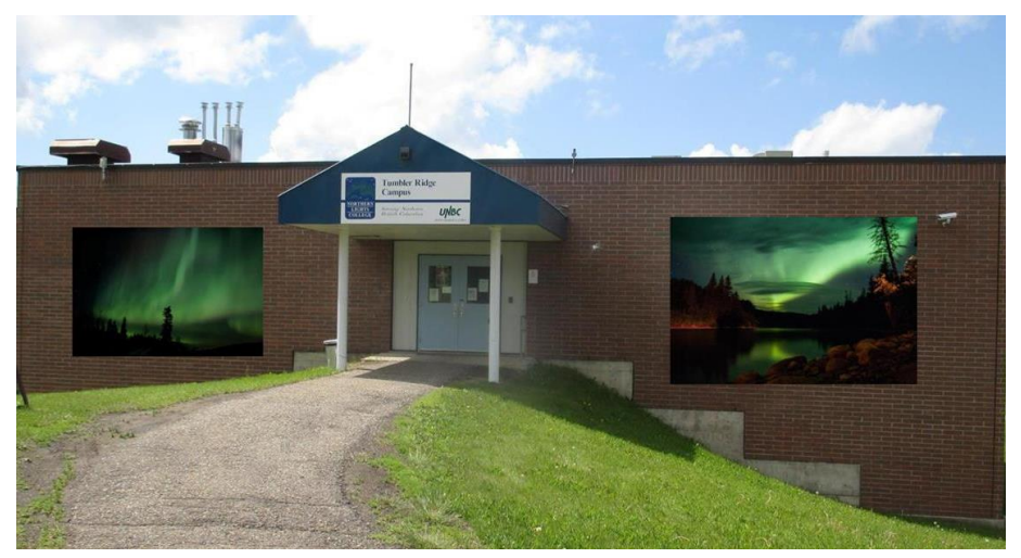
Northern Lights College Photos