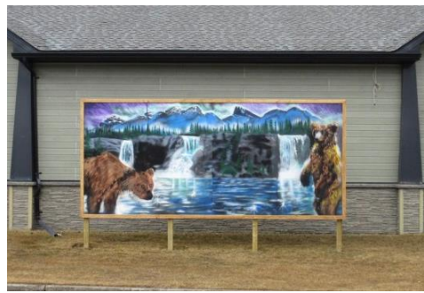
Monkman Falls Mural