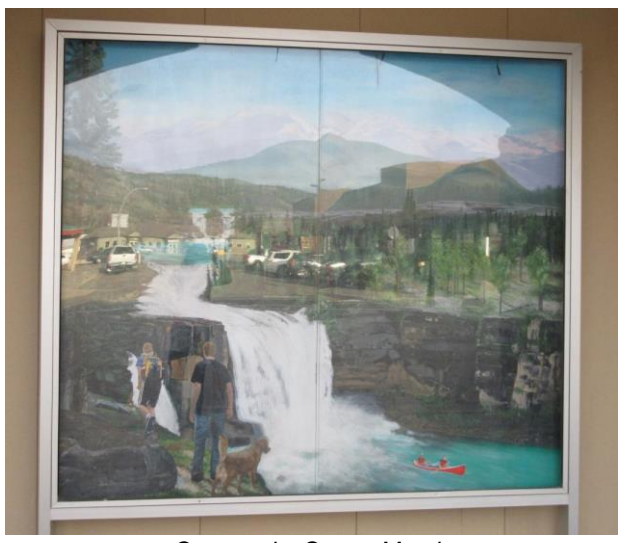
Community Centre Murals