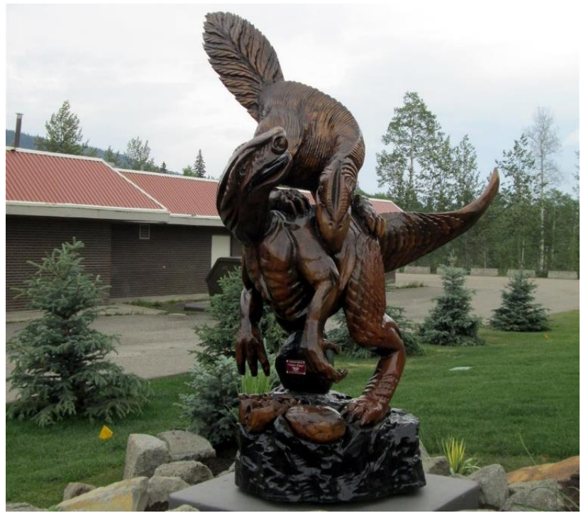
Chainsaw Carving beside the Visitor Centre

This attractive log building was completed in July 2015. It houses Visitor Information Services, which is managed by the Tumbler Ridge UNESCO Global Geopark (TRUGG), along with office space for TRUGG staff. The building boasts in-floor heating, and large windows that overlook some of the adventure destinations visitors might want to see.