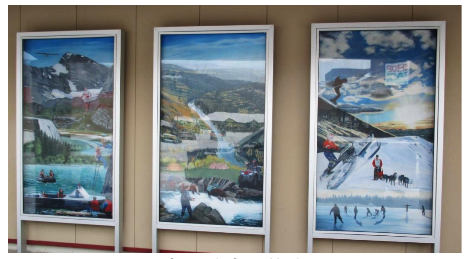
Community Centre Murals

Joan Zimmer used photographs of local activities and scenery to paint the five mural collages on this wall. They showcase everything from skating, dogsledding, snowmobiling and skiing in winter, to boating, fishing, hunting, rock climbing, finding dinosaur footprints, swimming, running and hiking in our outdoor wilderness.